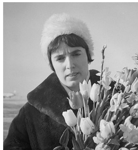
Gaprindashvili in 1963