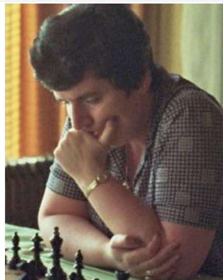
Gaprindashvili at Bad Kissingen, 1982